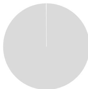
1. Taxonomy-alignment of investments including sovereign bonds*

The two graphs below show in green the minimum percentage of investments that are aligned with the EU Taxonomy. As there is no appropriate methodology to determine the Taxonomy-alignment of sovereign bonds*, the first graph shows the Taxonomy alignment in relation to all the investments of the financial product including sovereign bonds, while the second graph shows the Taxonomy alignment only in relation to the investments of the financial product other than sovereign bonds.